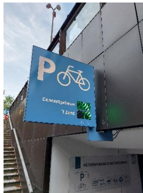
Bike parking in Brugge